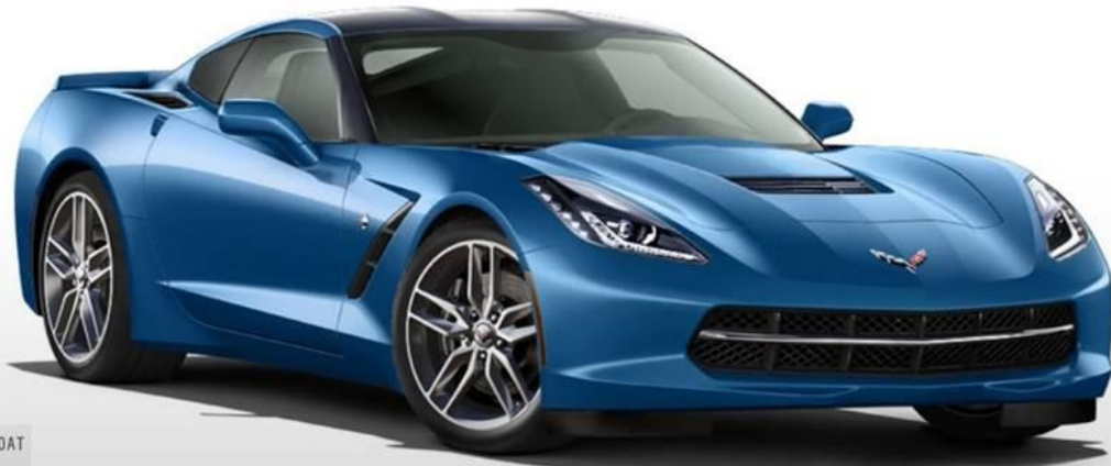
LAGUNA BLUE TINTCOAT STERLING SILVER

SHOWN WITH Z51 PERFORMANCE PACKAGE AND VISIBLE CARBON-FIBER ROOF.